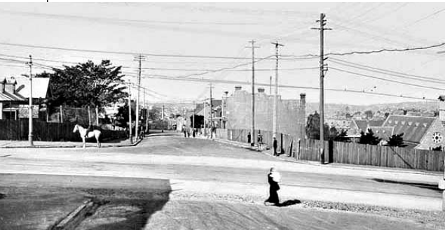
If the trams were off, you could always ride your horse! Here's looking down Blue Street from the Miller Street corner about 1923. The person on the horse is roughly at the entrance to North Shore Gas Coy (or what is now NSW Health Services).